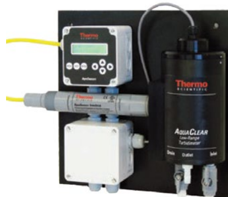
AquaClear system with digital AV38 display