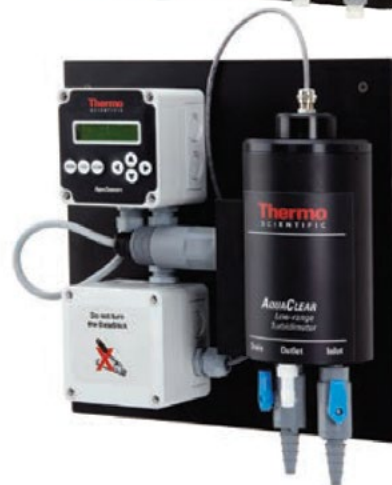
AquaClear system with analog AV88 display